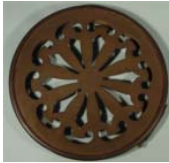
The back before cleaning

Marblack. Copyright Meadows & Passmore and Mervyn Passmore, 1 Ellen Street, Portslade Brighton BN41 1EU 2008