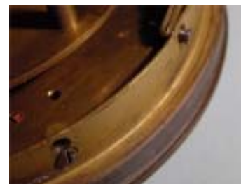
The outer screws that hold the bezel