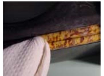
Wax the inlay carefully

Before applying Marblack, we need to protect any inlaid areas. Do this by carefully applying two coats of good beeswax furniture polish to the inlay. You must use an old fashioned wax, not a modern spray polish. Sprays are often water based silicone emulsions, in some ways similar to Marblack, and will provide no protection against the strong black pigments.