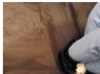
Second coat, in lines.