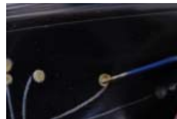
Apply a drop to each circle with a pin or paperclip

This is a good time to give the dial a wipe with a cotton wool pad moistened with some mild soapy water. Reassemble.