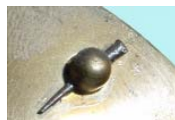
Don't touch the pins