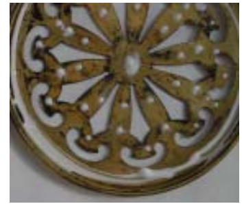
Spots of glue to hold the fabric