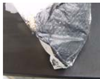
Some Marblack is bound to lift off onto the polishing rag.