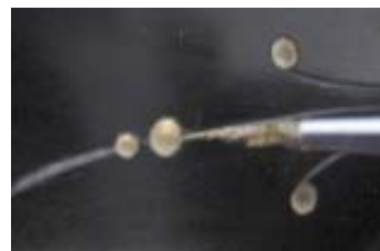
Using a brush with only a few hairs, draw the gilt varnish along the lines