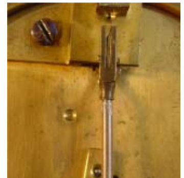
Unhook and remove the pendulum

When both screws have been removed, the back should lift away and the movement can be withdrawn from the front. Place the movement and the back, with the retaining screws, in a safe place.