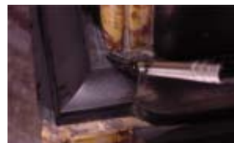
Brush parts you cannot reach with a rag.

Start by using the pin or paperclip to thoroughly clean the grooves etc. The deeper and cleaner you can