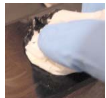
First coat in a circular motion

Rub the Marblack liberally into the surface using a rag, carefully avoiding the