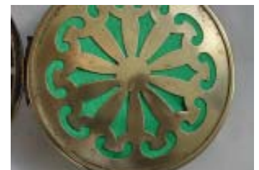
The finished back