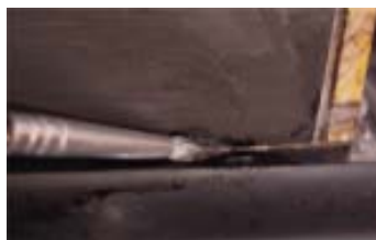
Run Marblack into the joints with a brush

Using an artist's paintbrush, make sure some Marblack runs into the cracks in the joints. This will run into the white plaster that holds the case together.