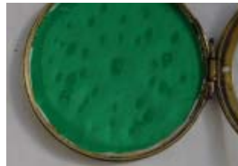
Press the fabric into position