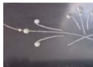
Only a few areas of gilding remained when cleaned out